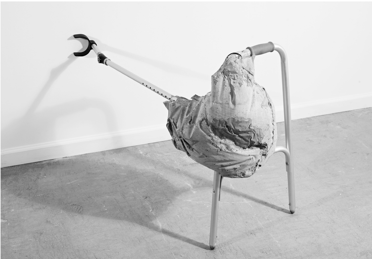
"Death; death? It's certain death, but with what speed and with what dash!" Ambulatory products, concrete, bronze, 2009.

JUSTIN MATHERLY Interviewed by GABRIELLE GIATTINO August 2009