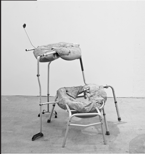
"The set of means arranged in conformity with a plan; a little organized matter disorganized; a few compositional changes, dispose the group, unassemble them. T'was an agreeable episode, now we'll essay another." Ambulatory products, concrete, 2009.

JM: This is actually a concern that has been present for some time now (conscious or not) as I have almost always noticed elements of a totalitarian nature within the work. This occurs sometimes in the forms themselves or in the way they 'exist' and within their relationship with the viewer. At the same time there exists a vulnerability within the work (both within the forms and within the relationship to the viewer) that contradicts an overall authoritarian reading. It seems for Adorno and Horkheimer that this contradiction is inherent to Enlightenment as such, for example: "Enlightenment stands in the same relationship to things as the dictator to human beings", and for them already contains "the germ of regression". It is essential to 'reflect on this regressive moment,' otherwise Enlightenment "seals its own fate". Sade's reason, his unyielding and intransigent use of reason, is meant to shed light on the totalitarian aspect of reason unchecked. It is in this pursuit of the 'implications of reason,' that Adorno and Horkheimer see a laying bare the utopia contained in all great philosophy, that is the utopia of a humanity no longer distorted, hence no longer needs distortion. As this is an important concern within my work I have hopefully answered to the best of my abilities the question posed, but this is not to say that I have fully answered the question.